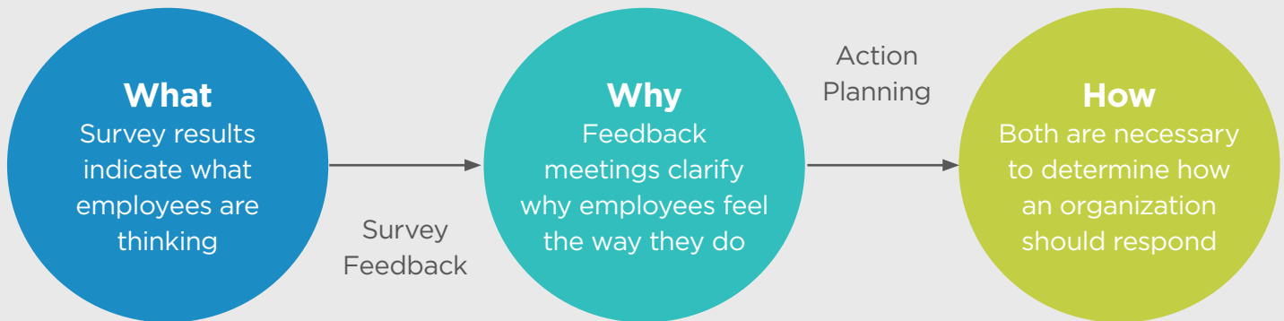
FIGURE 4 Clarifying Survey Results: What, Why and How